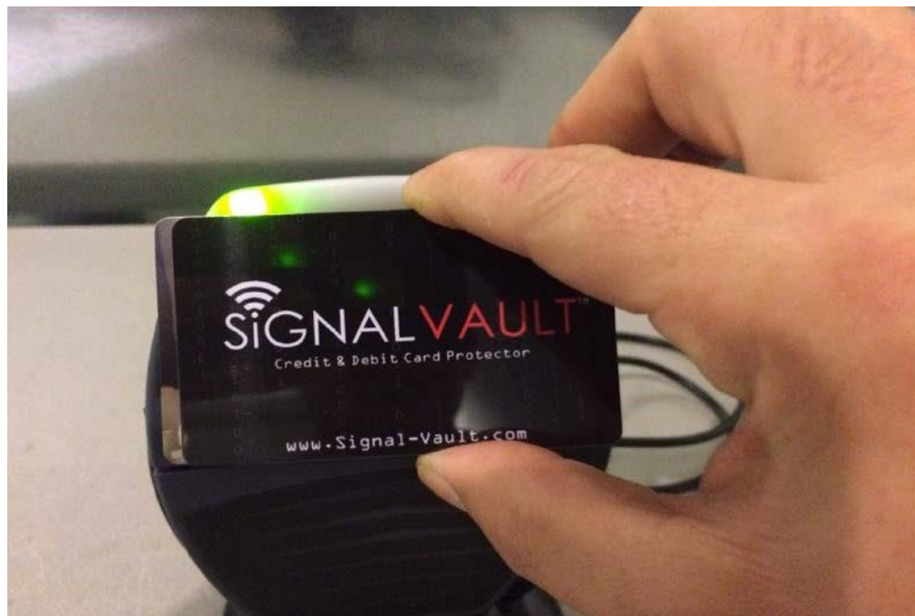
Figure 5: Step 2 (SignalVault V.1, Front Side Scan)