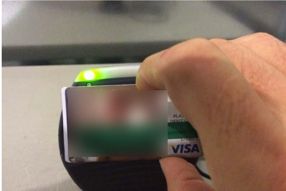
Figure 4: Step 2 (SignalVault V.2, Back Side Scan)