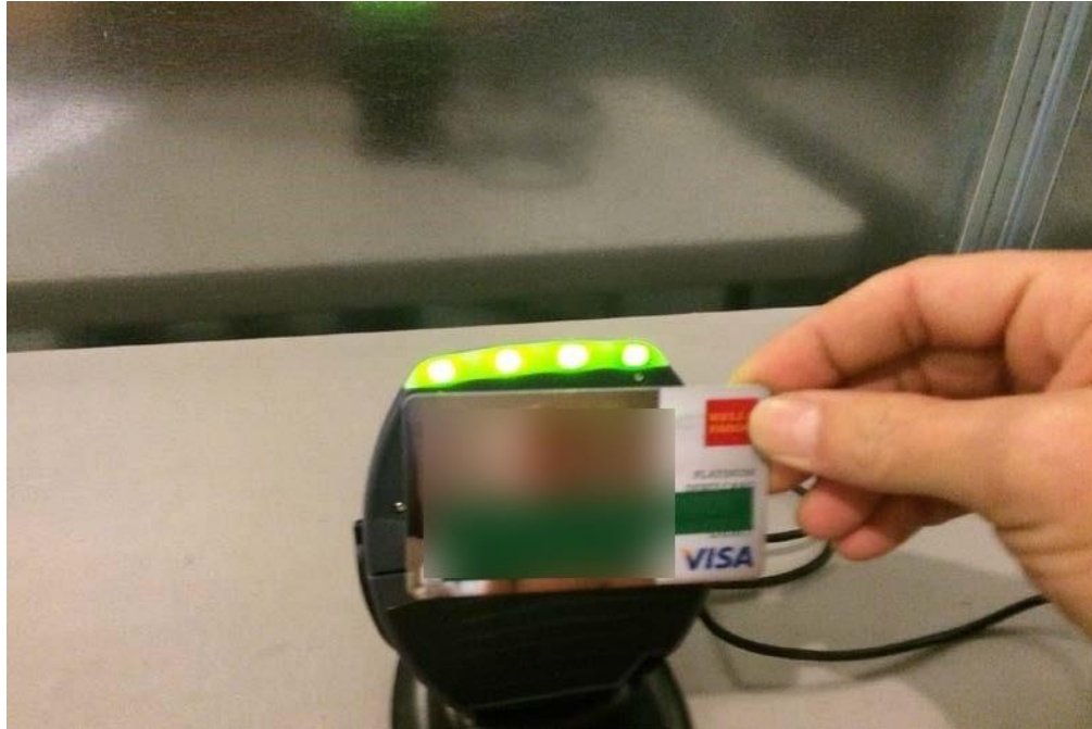
Figure 2: Step 1 (Card Reader, Verification of Proper RFID Operation)