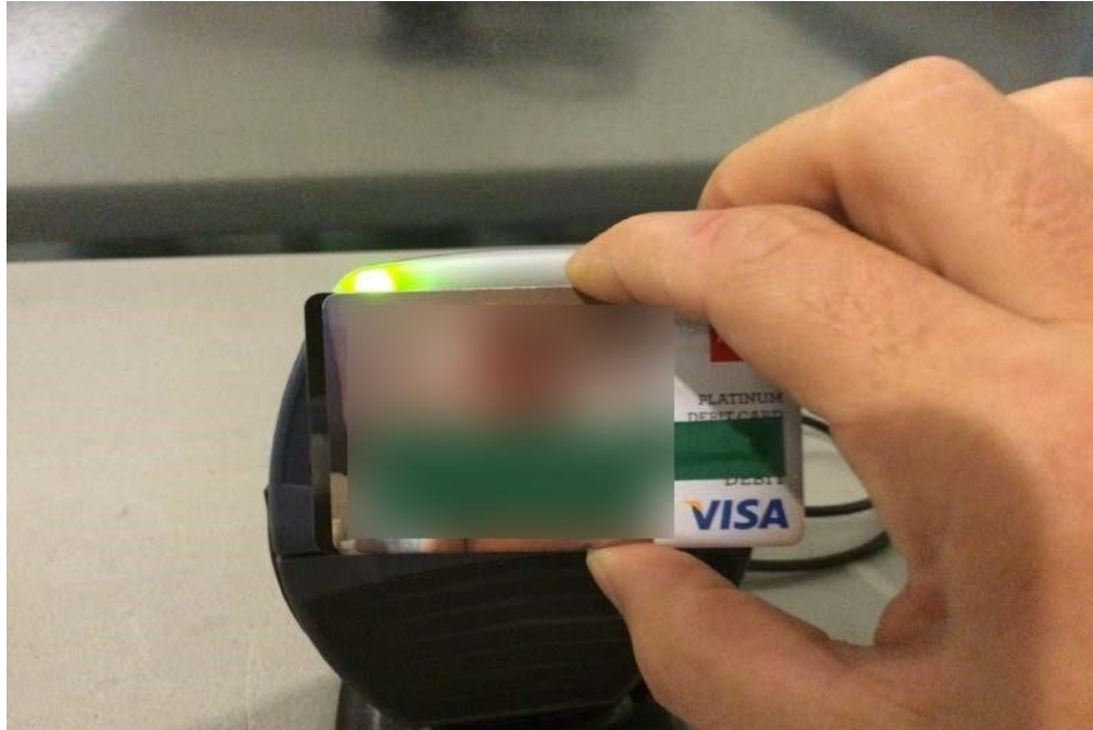
Figure 3: Step 2 (SignalVault V.1, Back Side Scan)