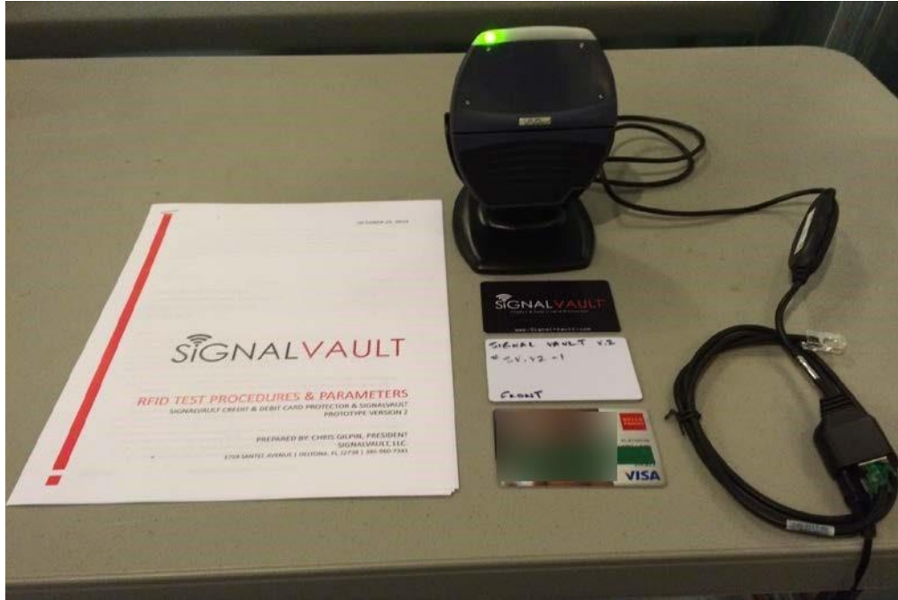
Figure 1: Overall Setup Photo